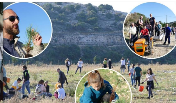
Outdoor activity, "Plant a tree, don't be a stump"