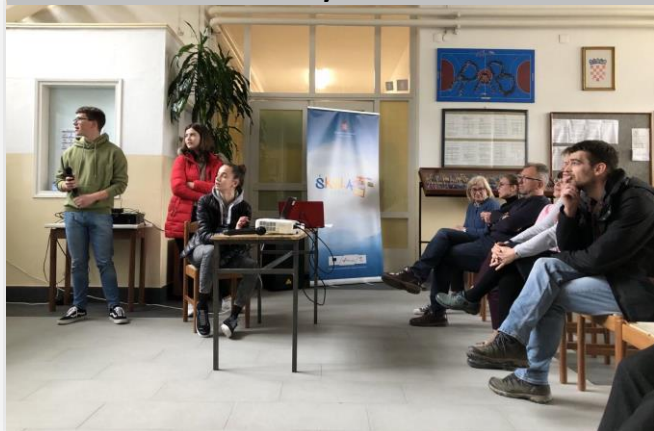
International day of mathematics