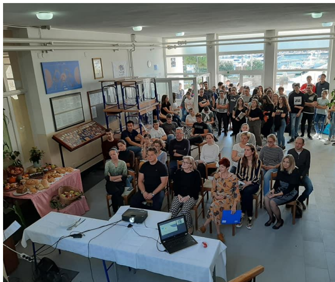
World bread day