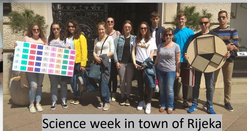
Science week in town of Rijeka