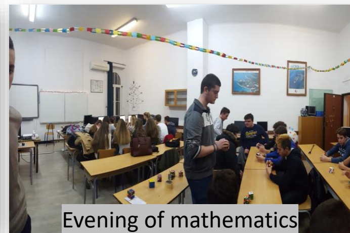
Evening of mathematics