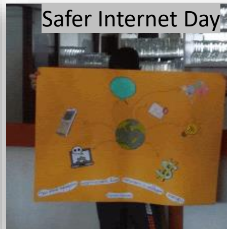
Safer Internet Day