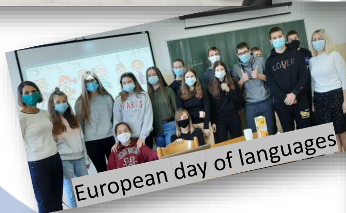
European day of languages