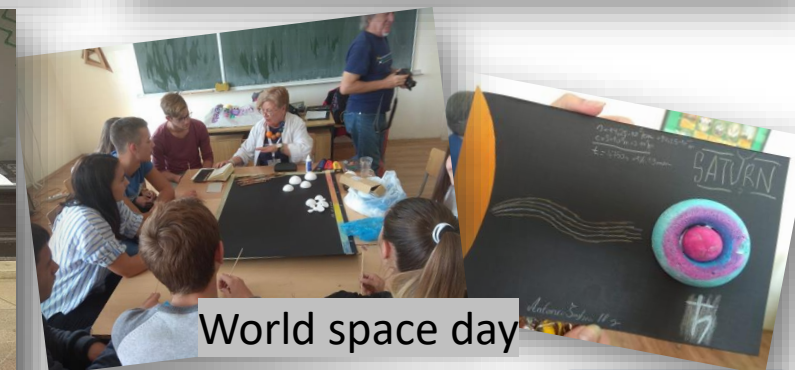
World space day

GAMMA: Project No. 2020-1-HR01-KA201-077794